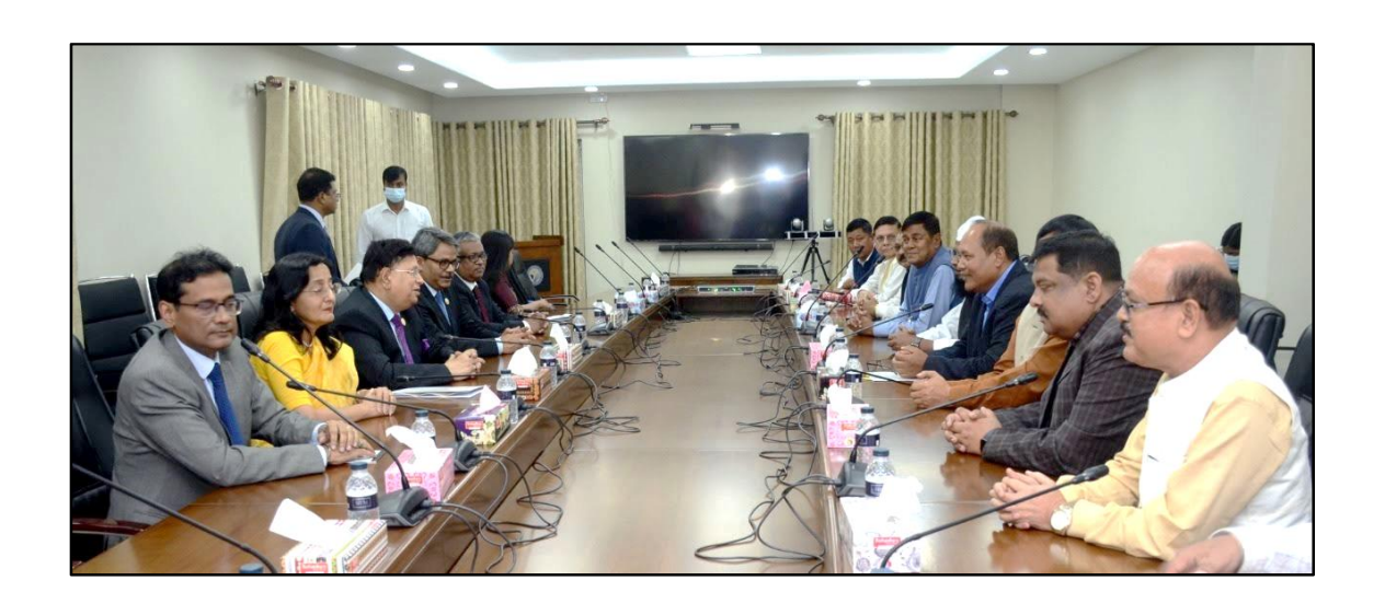
Assam Assembly delegation meeting with the Hon'ble Foreign Minister of Bangladesh