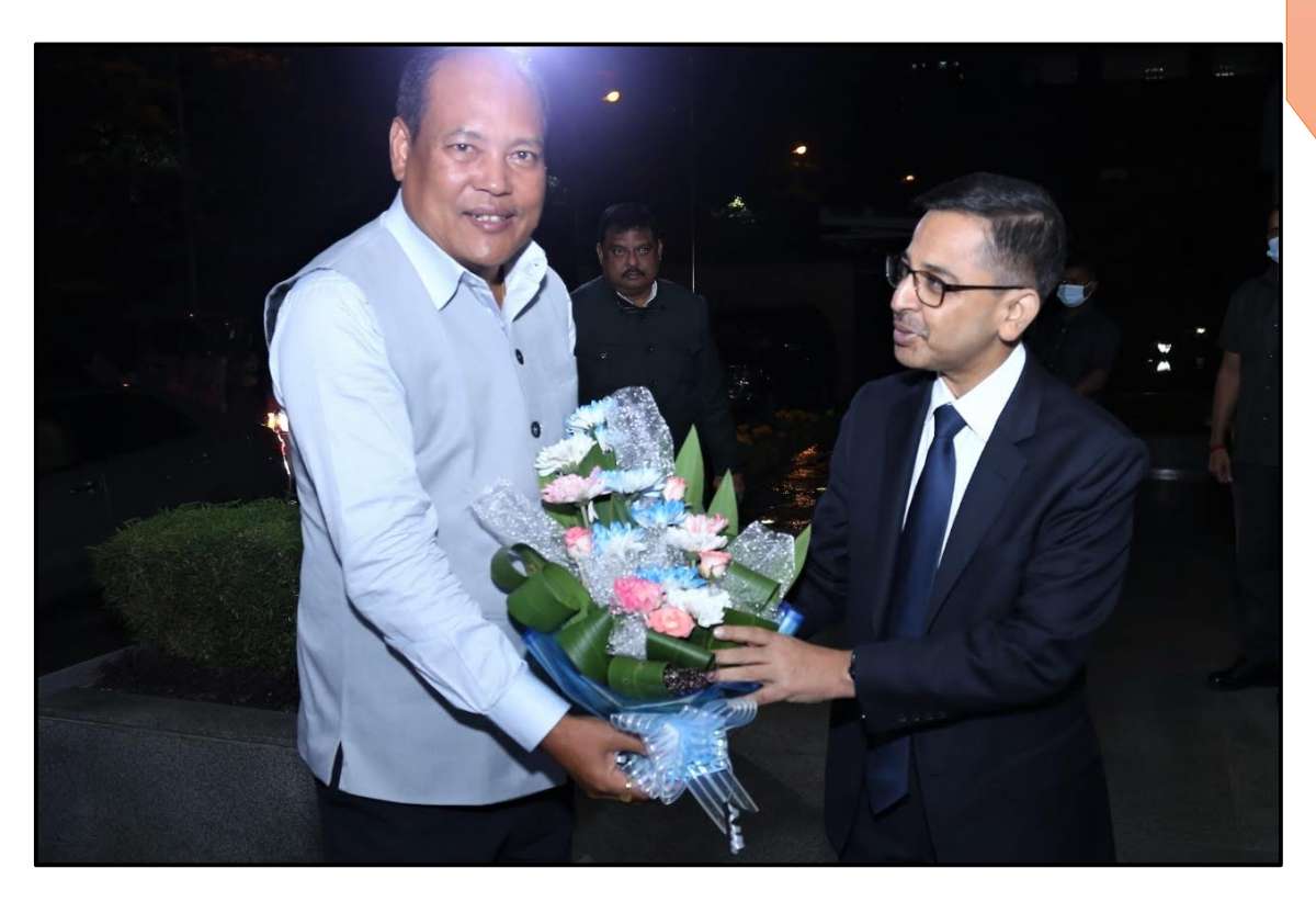
High Commission of India, Bangladesh Shri Pranay Kumar Verma welcoming the Hon'ble Speaker of Assam