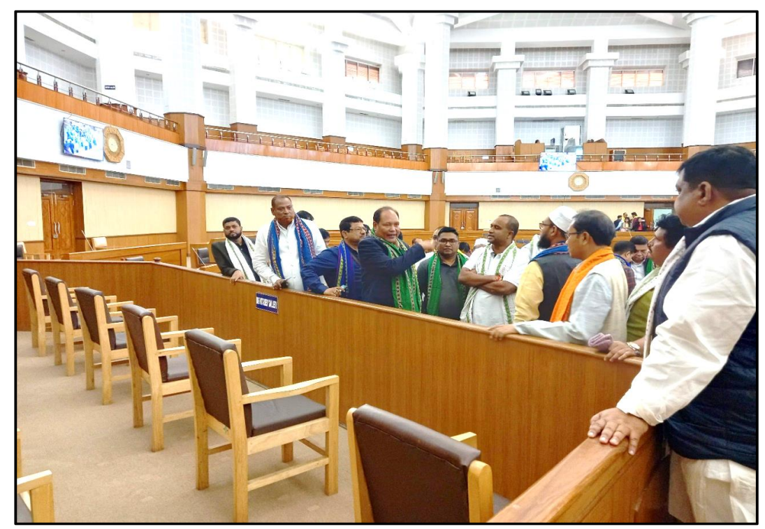
Hon'ble Members inside the Tripura Legislative Assembly