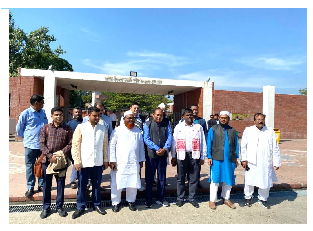
Hon'ble Members of Assam Assembly at the Bangabandhu Sheikh Mujibur Rahman Mausoleum Complex.