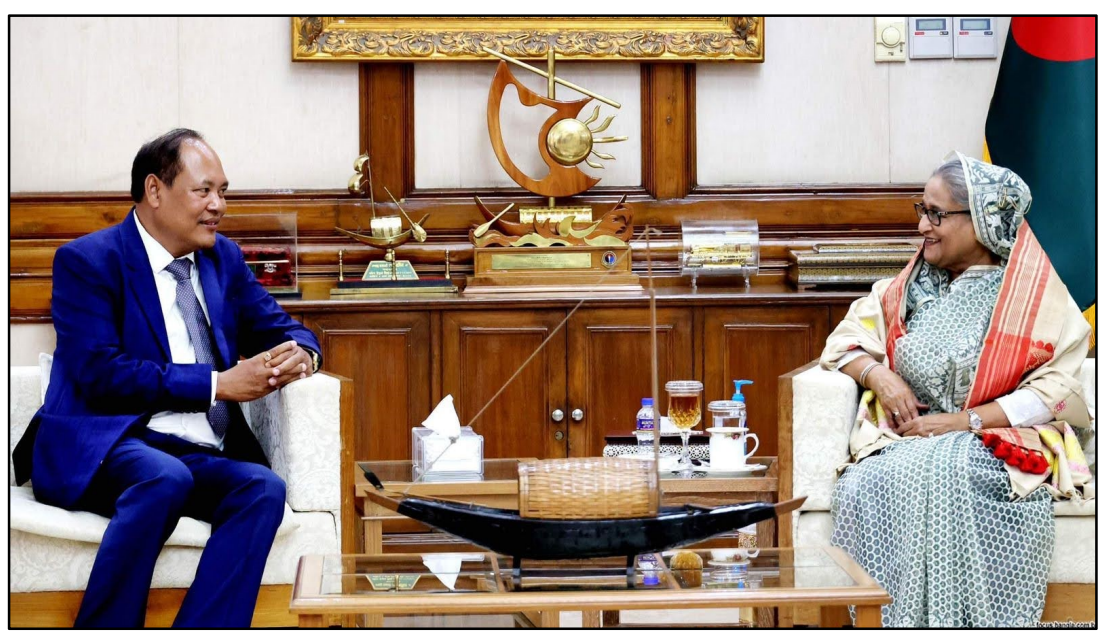
Hon'ble Speaker, Assam Assembly Shri Biswajit Daimary with H.E. Sheikh Hasina, Prime Minister of Bangladesh.