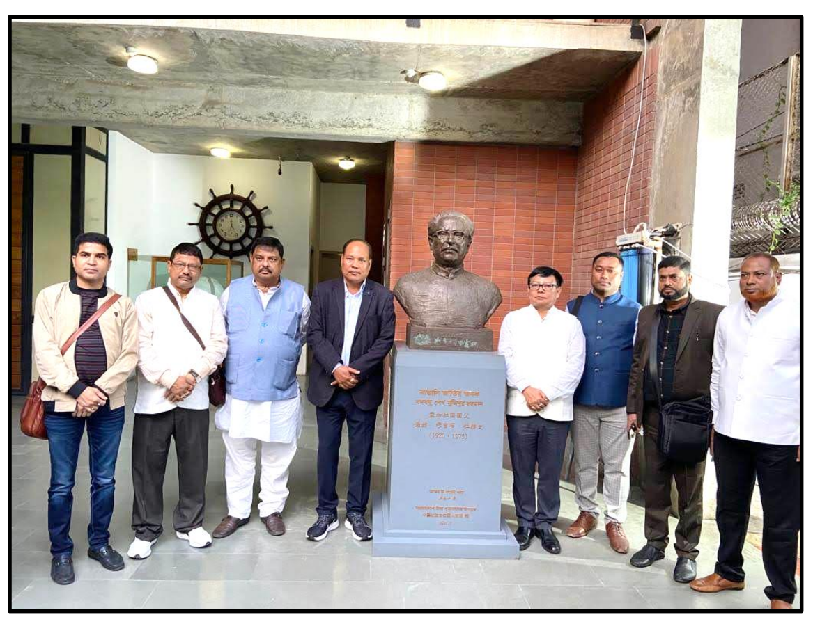
Some members of the delegation at Bangabandhu Sheikh Mujibur Rahman Memorial Museum

The delegation had a night halt at Agartala on 18<sup>th</sup> November, 2022 and thereafter proceeded to Bangladesh on the morning of 19<sup>th</sup> November, 2022. The delegation was accorded a warm welcome by the representatives of the Bangladesh Government and the High Commission of India, Bangladesh at the Immigration Centre in Akhaura border. On reaching Dhaka, the delegation immediately proceeded to visit the Bangabandhu Sheikh Mujibur Rahman Memorial Museum in Dhaka at 5 pm. It was an enriching and educative experience visiting the museum.