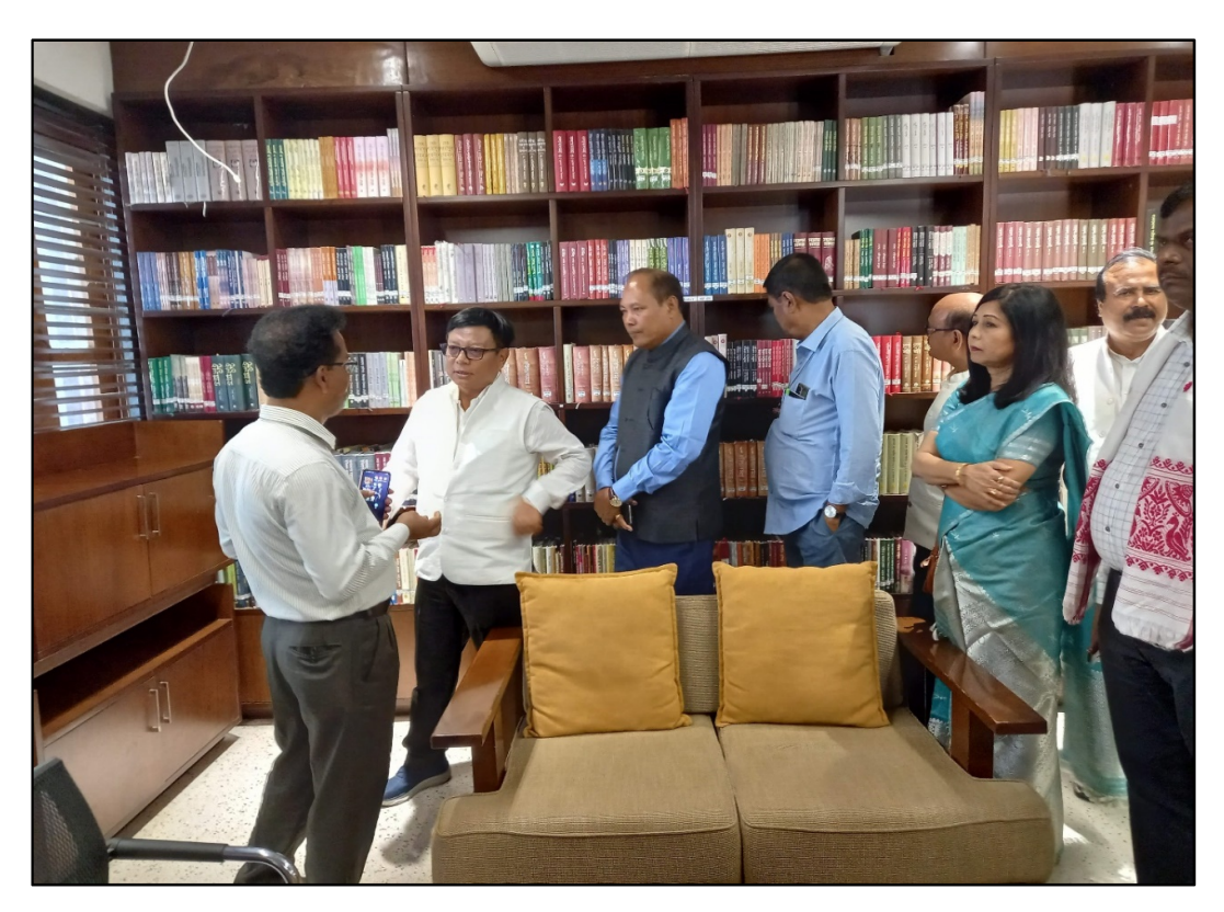
Hon'ble Members at the Bangabandhu Memorial Library