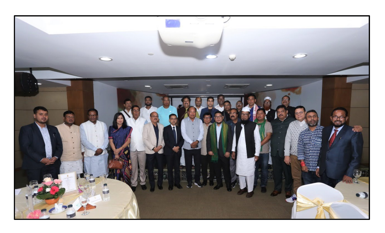
Members of the delegation with High Commission of India, Bangladesh officials after the dinner