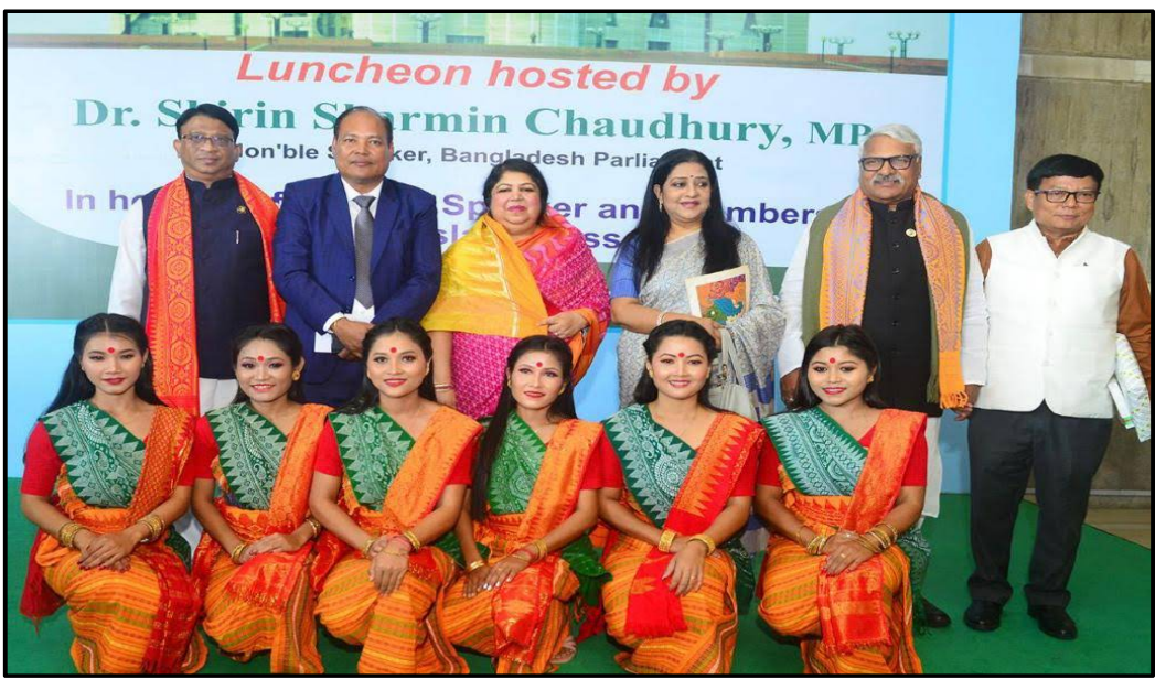
Some members of the cultural troupe with Hon'ble Speaker, Bangladesh Parliament and other dignitaries