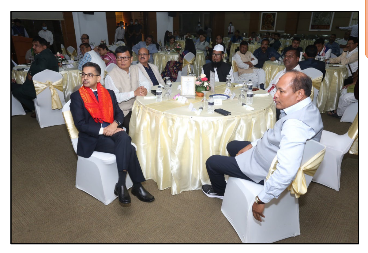
Dinner Programme hosted by the High Commissioner of India Bangaldesh.