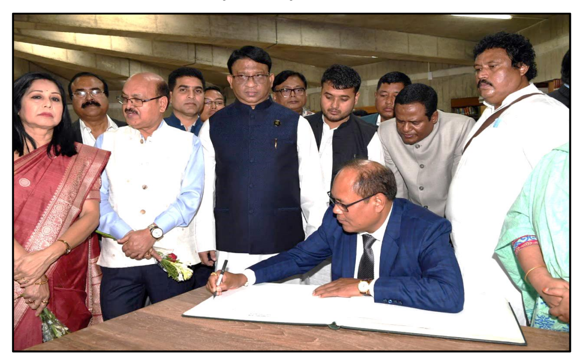
Hon'ble Speaker, Assam signing the Visitor's Book in the Bangladesh Parliament Library

After meeting with the Hon'ble Prime Minister of Bangladesh, the Assam Assembly delegation visited the Bangladesh Parliament library and the Bangladesh Parliament (Jatiya Sangsad) on 20<sup>th</sup> November, 2022. In the Parliament library, they have one Sheikh Mujibur Rehman corner where two seats are placed in which one can read books about Sheih Mujibur Rahman. The books about him are placed in the shelf beside the seats. This is a novel concept which can be replicated in Indian Parliament/Assam Assembly wherein we can have a Mahatma Gandhi corner in Parliament library and Gopinath Bordoloi corner in Assam Assembly library.