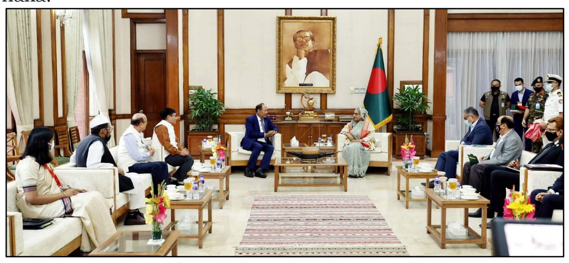
The Assembly delegation meeting with H.E. Sheikh Hasina, Prime Minister of Bangladesh

On the morning of 20<sup>th</sup> November, 2022, a team from the Assam Legislative Assembly led by the Hon'ble Speaker, Shri Biswajit Daimary met Her Excellency Sheikh Hasina, Prime Minister of Bangladesh at her official residence Ganabhaban in Dhaka.