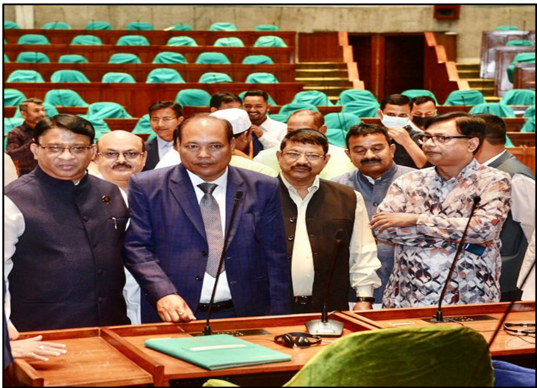
Hon'ble Members of Assam Assembly inside the Bangladesh Parliament