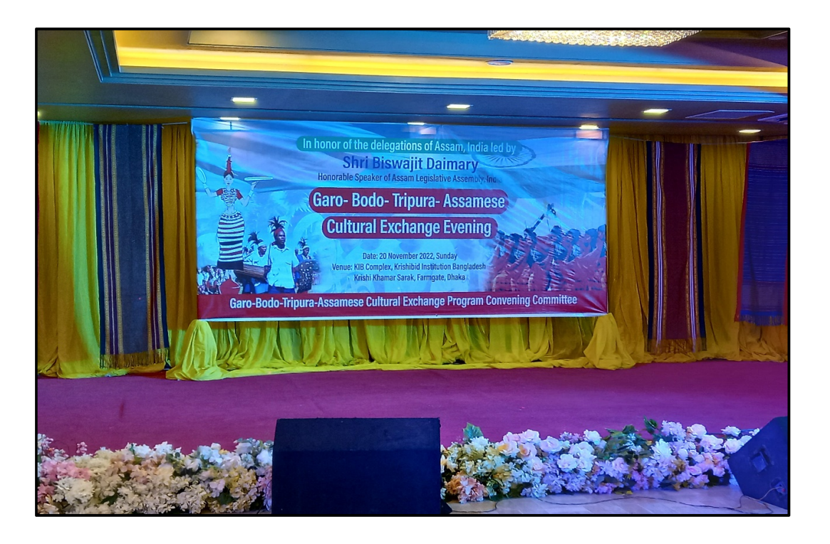
(vii) Garo-Bodo-Tripura-Assamese Cultural Exchange Evening

In response, Shri Biswajit Daimary, Hon'ble Speaker of Assam said that Bangladesh witnessed massive developments over the years with the ongoing works of many mega projects. He expressed his view that there is a scope for increasing further the trade and economic relations between Assam and Bangladesh. Mentioning that India attaches higher importance in its relationship with Bangladesh in all spheres, the Speaker of Assam Legislative Assembly said that Bangladesh could increase imports and exports with Assam through land ports and also through waterways.