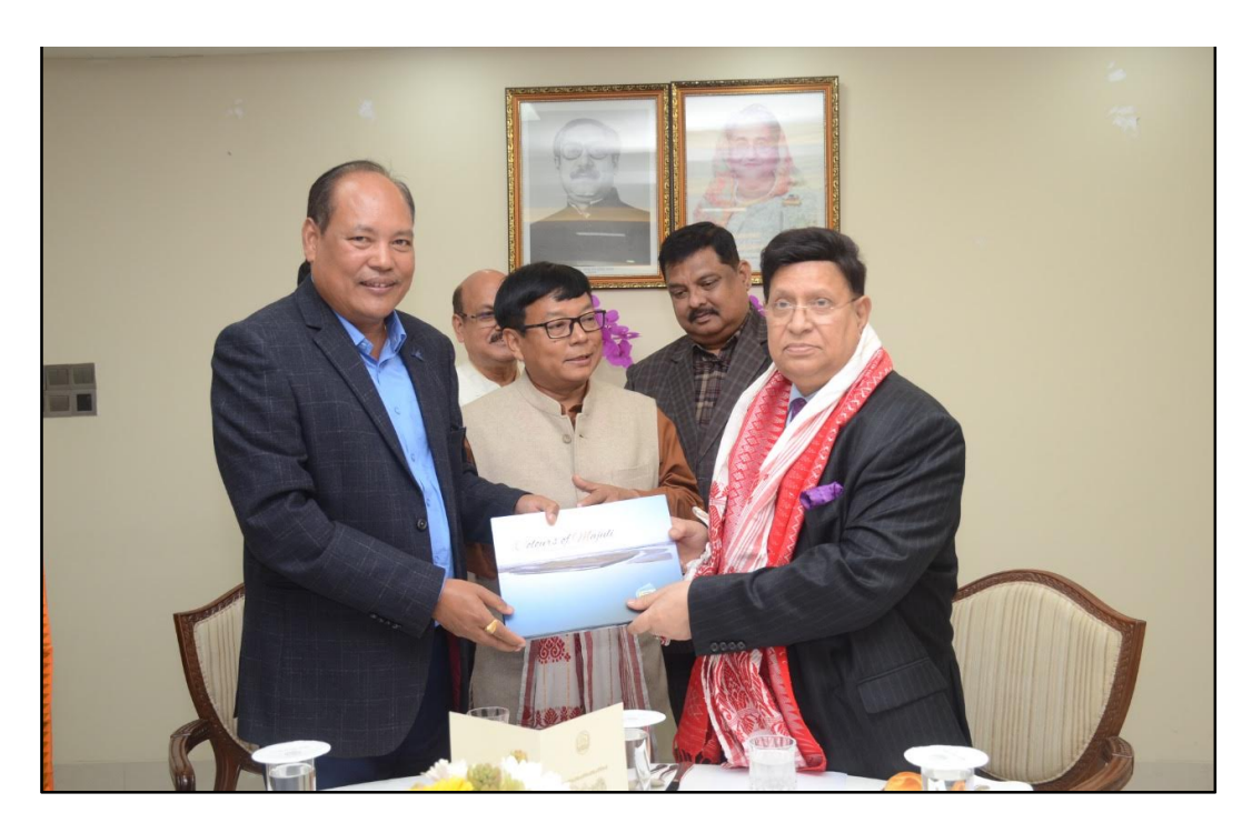
Hon'ble Minister, Assam and LOP with Hon'ble Foreign Minister of Bangladesh